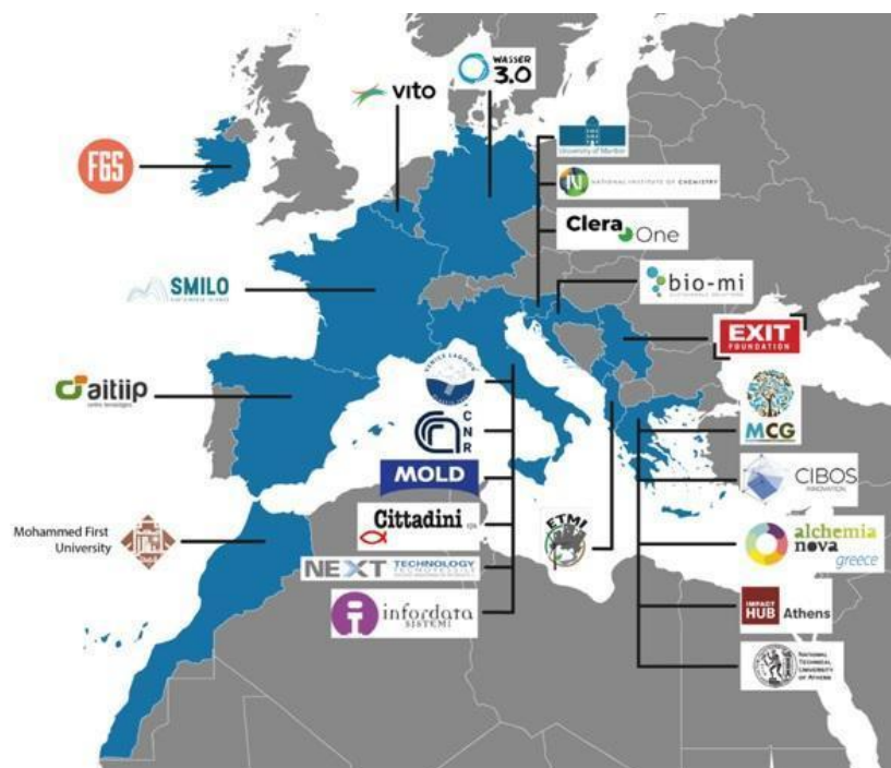
Figure 1: REMEDIES consortium of 23 partners from 12 countries