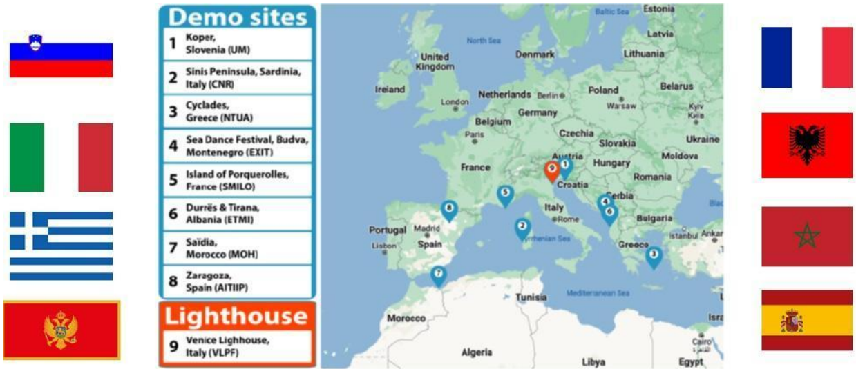
Figure 2: REMEDIES demo sites with the employed innovation on monitoring, collecting, and preventing plastic litter and microplastics in the Mediterranean Sea basin by 2025.